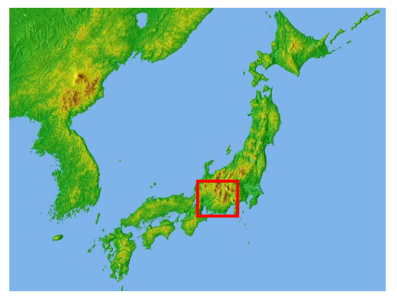
Fig.1 Location map of the Aichi Canal

The Chita Peninsula does not have a big river or a notable aquifer because of its narrow and hilly topography. The rainfall flows into the sea rapidly; therefore, it was 15,000 small reservoirs that would support the agriculture in the peninsula. People in the Chita Peninsula used to depend 70 to 90 percent of irrigation water on those reservoirs, or "dishponds", which were unreliable water sources with very limited capacities. Droughts would hit the area about once in three years, and the crops would be seriously damaged every time.