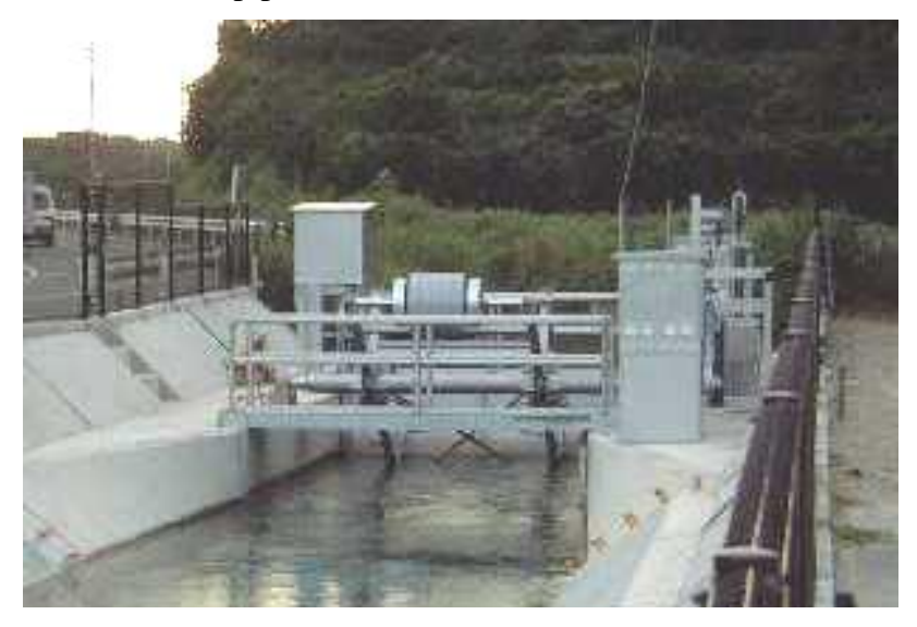
Fig.4 Mechanical Automatic Check-Gate

In the Aichi Canal 2<sup>nd</sup> Phase Project, the main irrigation channel was given a function of regulating ponds with the help of automatic check-gates because lateral systems were converted into pipelines.