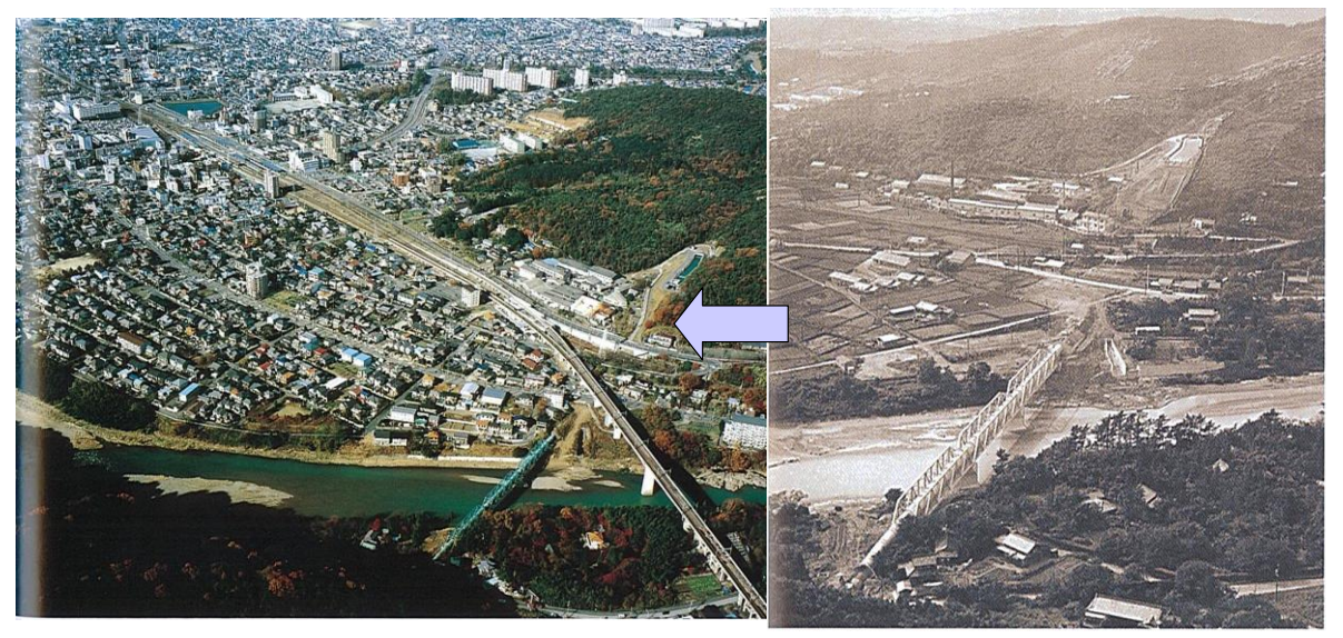
Fig.2 Rapidly developed surrounding area of Aichi Canal

To cope with shortages in potable and industrial water supplies, water allocation between irrigation, potable water and industrial water was changed in 1964 so that part of the volume originally allocated for irrigation was reallocated to the latter two sectors. For this reallocation was not enough to meet the growing water demand in the urban sectors, the Aichi Canal system as a whole shortly approached to its capacity limit.