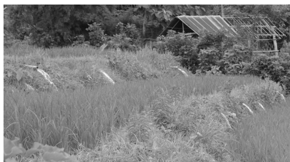
Photo 1 Plot to plot irrigation on terrace paddies in Northern Lao PDR