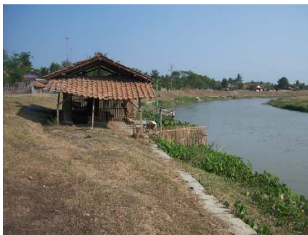
Fig. 2. Pump-irrigation system in the Bugis Main Canal with command area adjacent to existing JIS.

Pump-irrigation organization consists of pump's owner, pump's operator, and farmers. The organization leads by a pump's owner that usually a cleric and/or a wealthy local people in neighboring area. Pump operator has to manage a daily operation of the pumps and also acts as water regulator. The pump-organization is also acknowledged by the local community, village civil officers, and government officers who deal with agriculture activity.